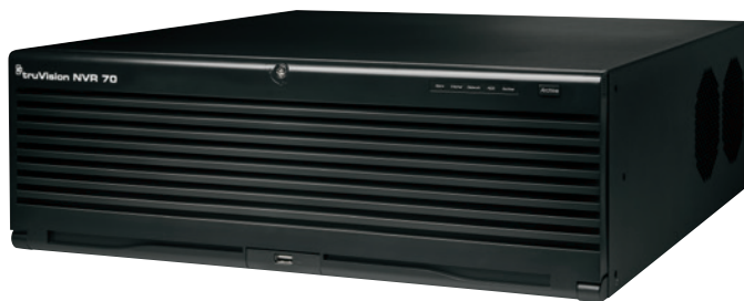
TruVision NVR 70

Select TruVision® Network Video Recorders (NVRs) by Interlogix can also be integrated with the Prism VMS. By downloading a driver pack, users are able to access and unlock recorded tracks via the Prism dashboard. Users can set up events for cameras connected directly to select TruVision NVRs for simple plug-and-play configurations. Ideal for small- to mid-scale applications, these recorders provide full support with the Prism Video Matrix.